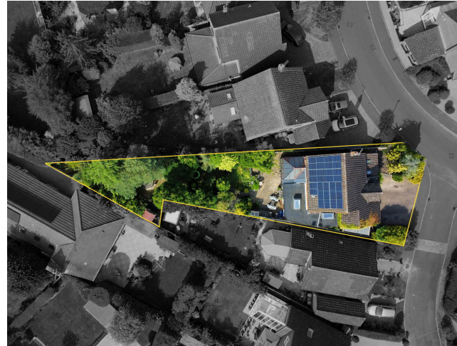
6 Lavenham Close, Nuneaton, CV11 6GP Approximate Gross Internal Area 2250 sq ft - 209 sq m